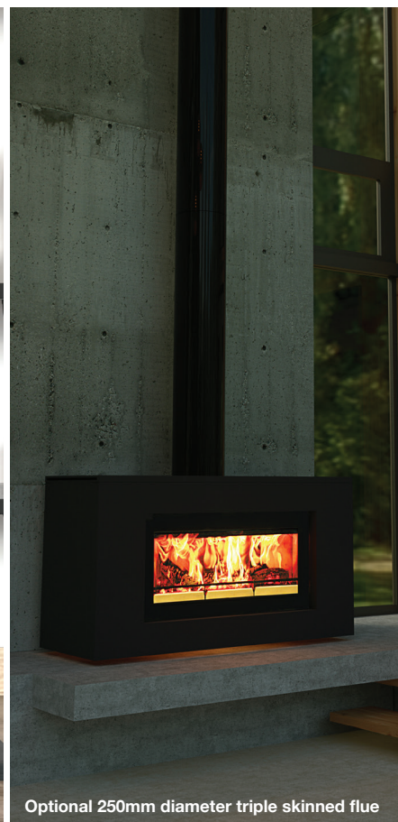
Optional 250mm diameter triple skinned flue