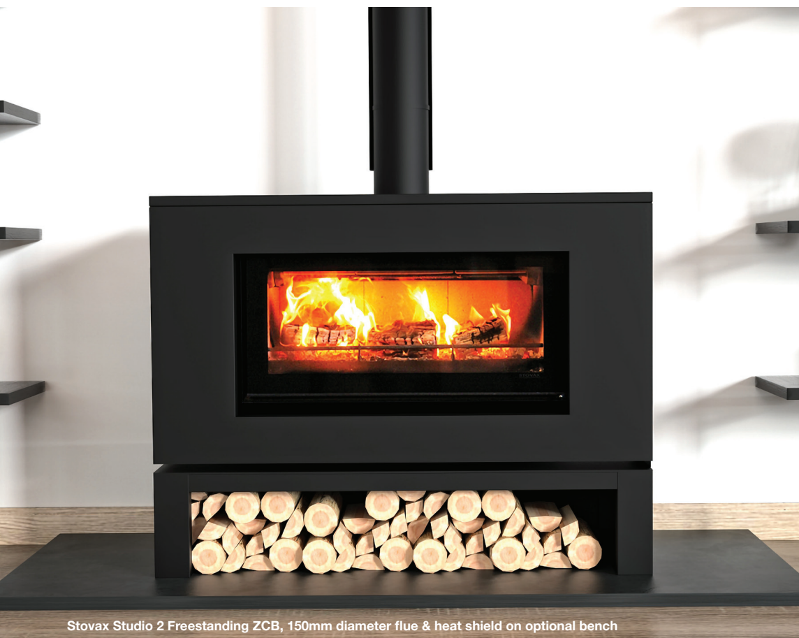
Stovax Studio 2 Freestanding ZCB, 150mm diameter flue & heat shield on optional bench