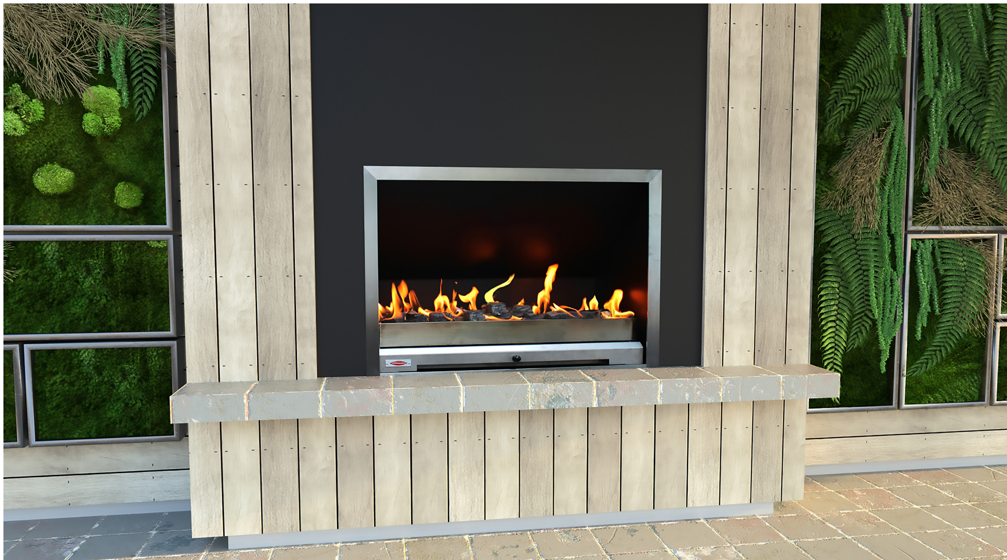
JETMASTER GAS | BROFF OUTDOOR FLUELESS FIRE