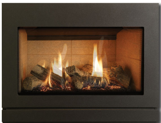
Designio2 Steel Graphite Frame, Vermiculite Lining