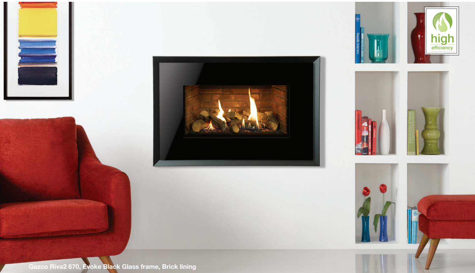
Gazco Riva2 670, Evoke Black Glass frame, Brick lining