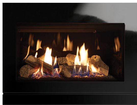
Designio2 Black Glass Frame, Black Glass Lining

The information on this brochure is to assist you in your choice of a suitable Gazco fire. This is not intended to be all the information required to install your fire. This can be obtained from your local Gazco retailer or you can download the full and current installation instructions from: thefireplace.co.nz